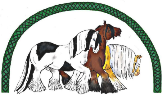
New England Gypsy Horse Club